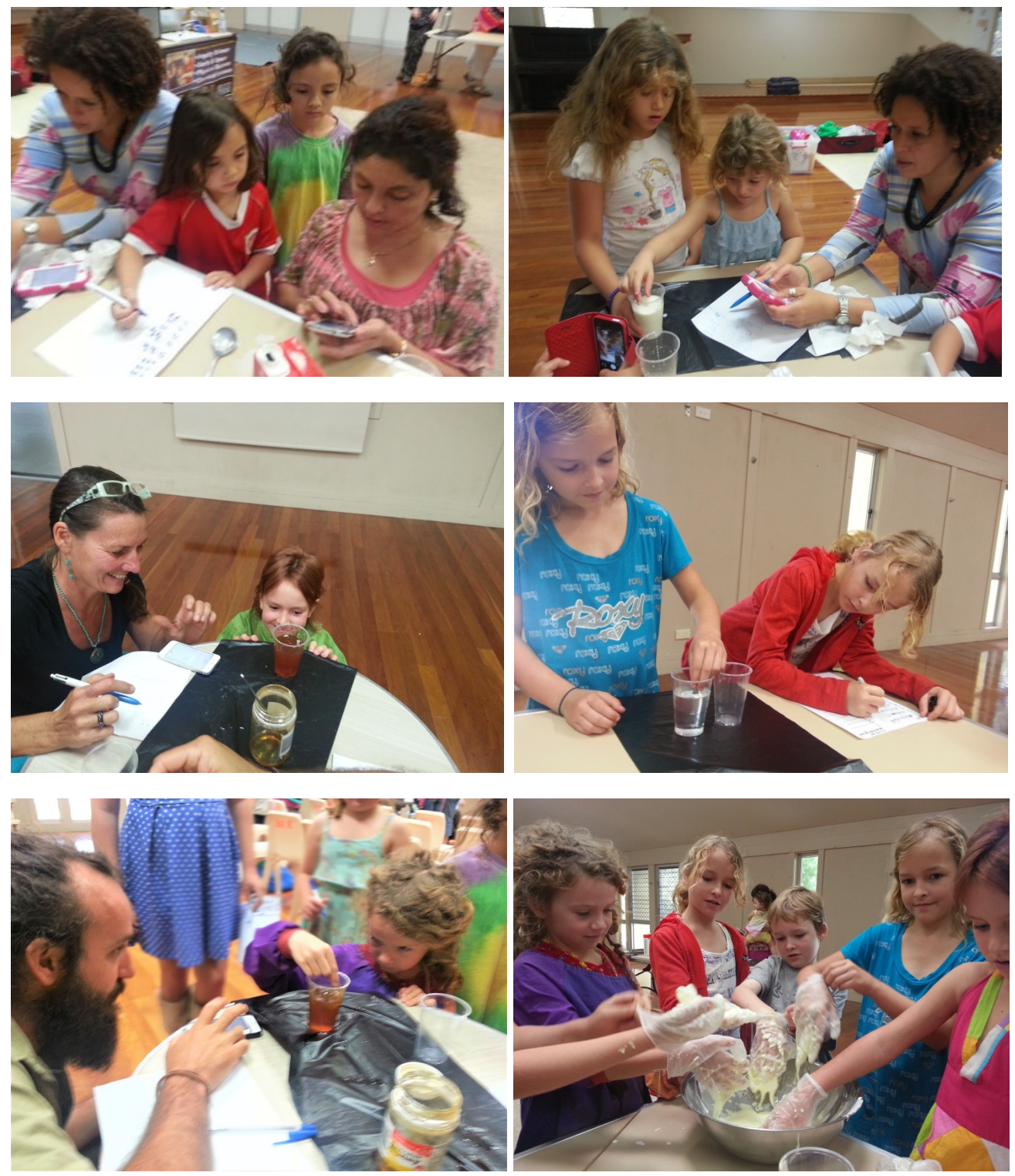
Be sure to use a stopwatch or smartphone!